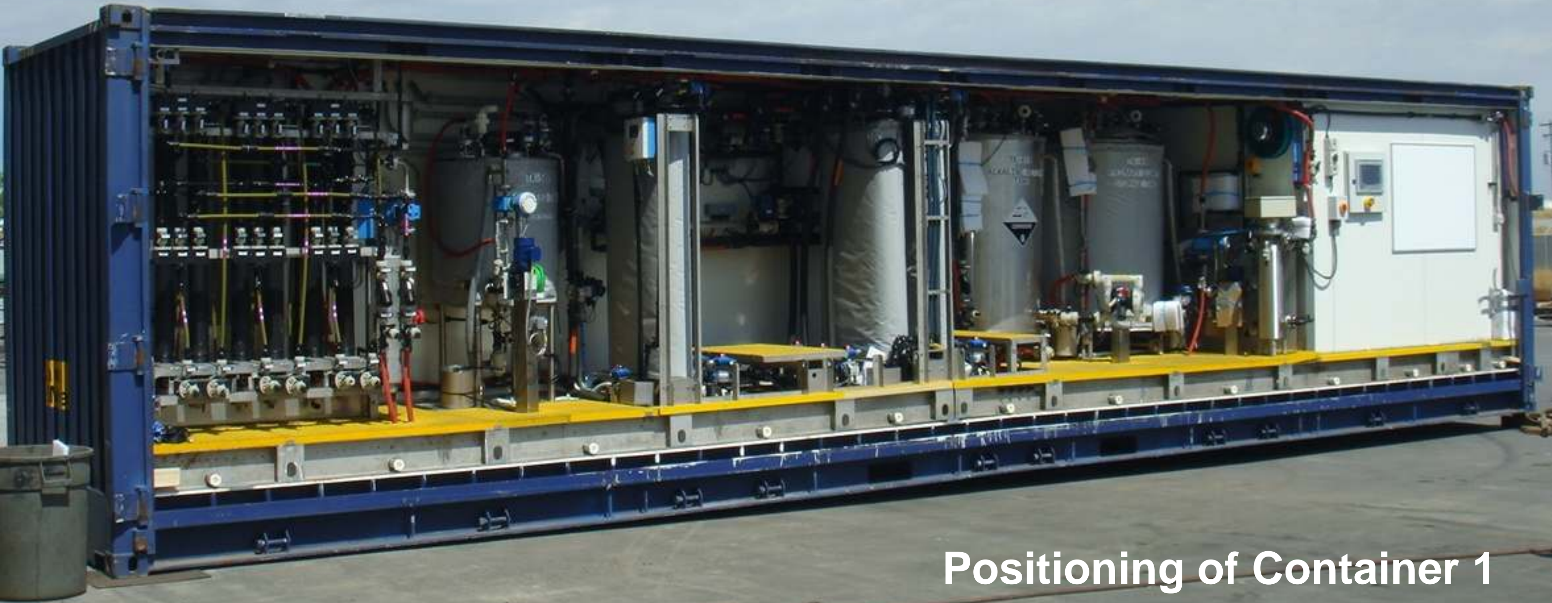
Positioning of Container 1