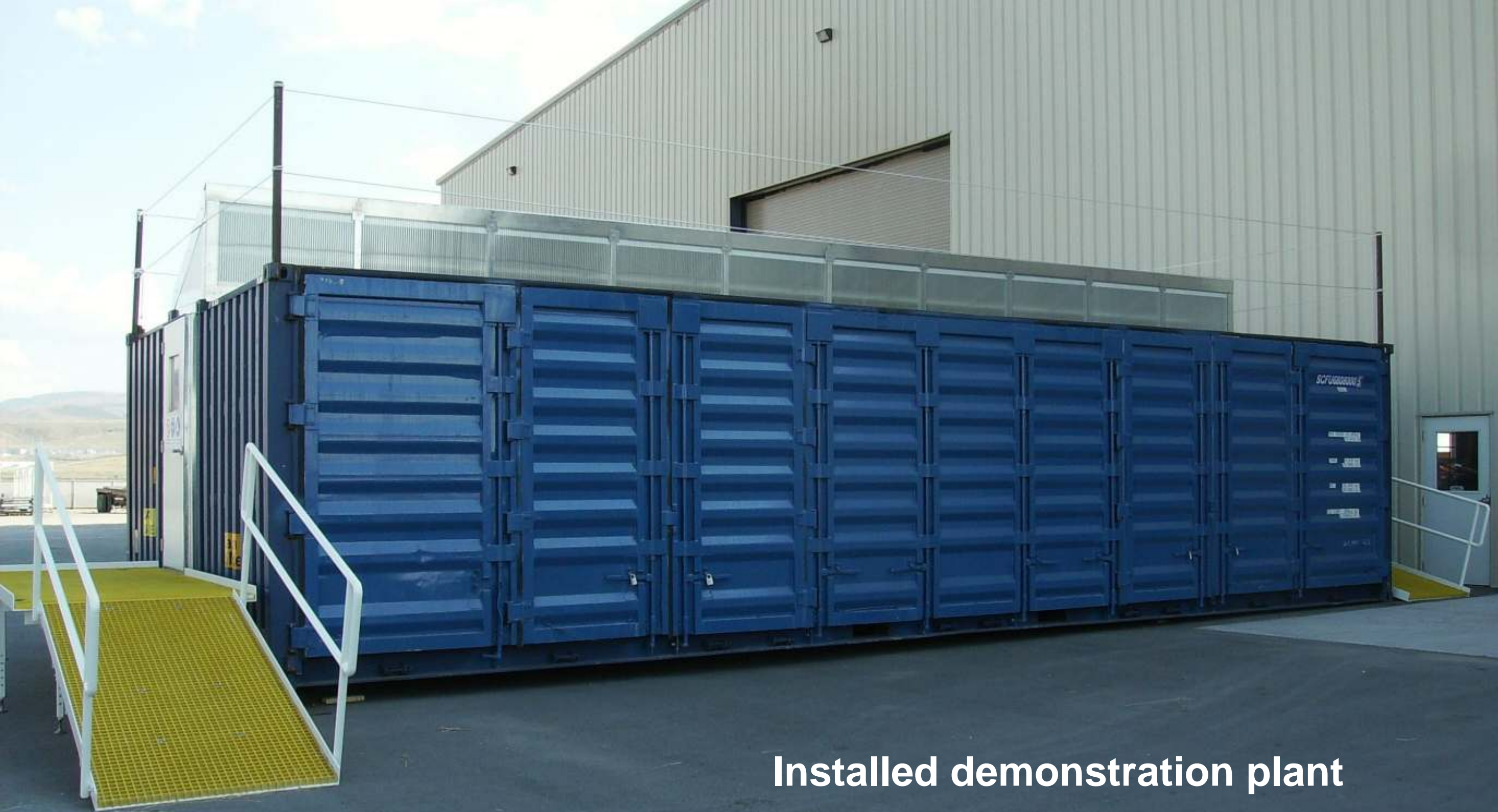
Installed demonstration plant