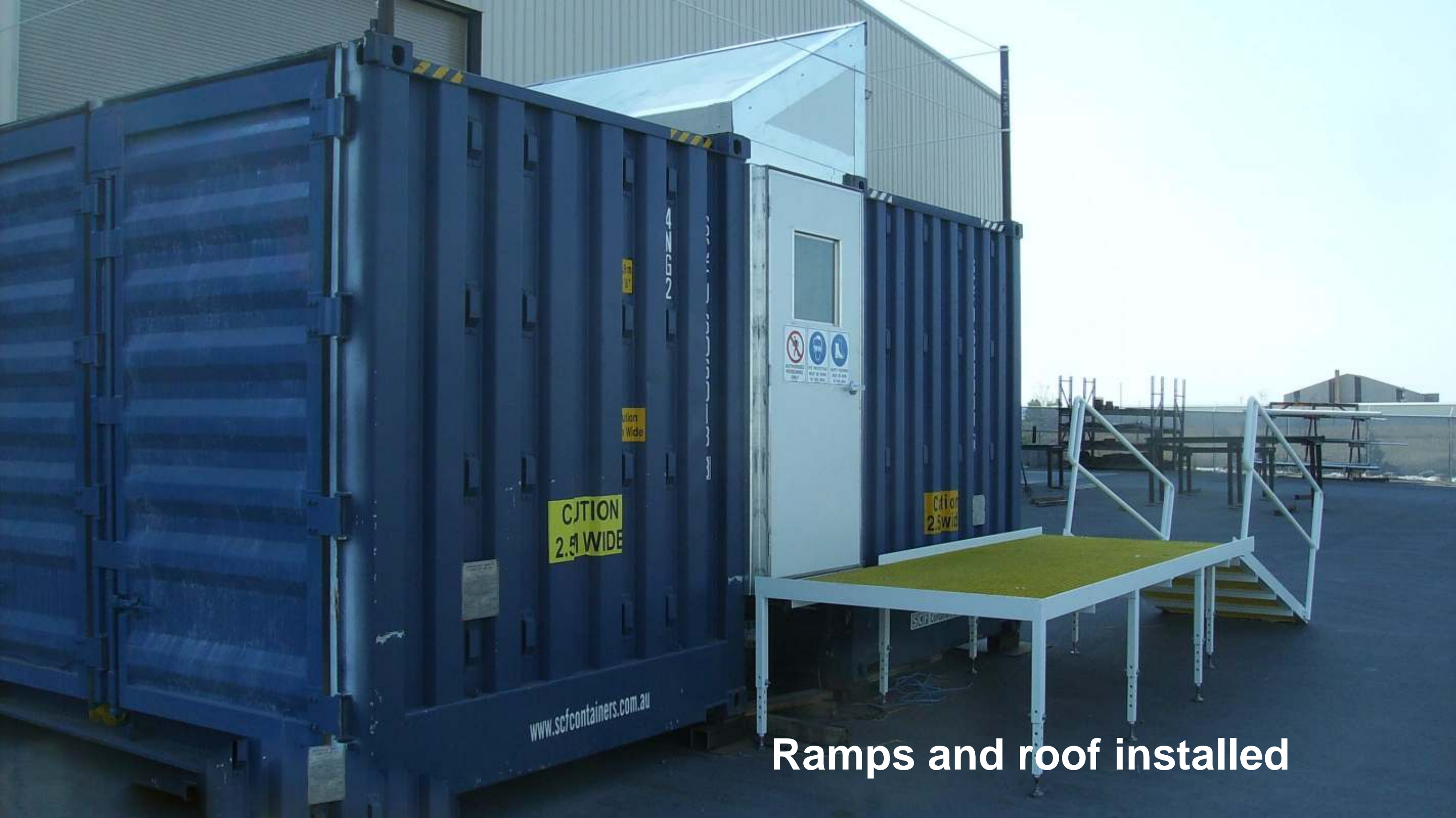
Ramps and roof installed